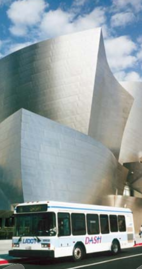
Walt Disney Concert Hall